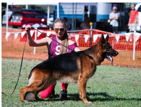
*TEO DI SANTA VENERE aED (Imp ITY) EXM1 SIEGER