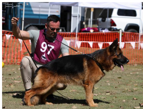
*CH. DEBBAR QUALL AZ EXM 2