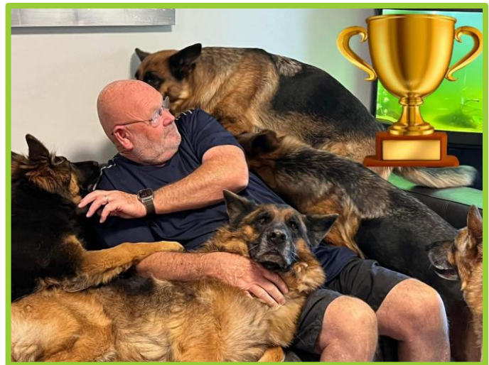
How much love can one man have?