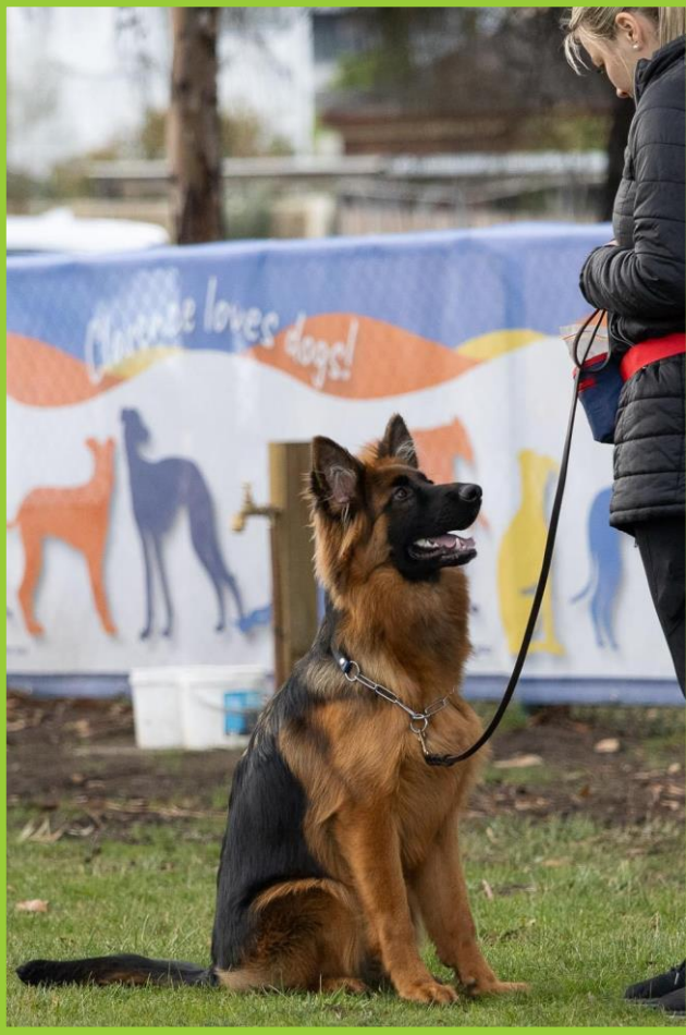
The look of love!

Thank you to the Judges that are sending through their critiques and summation from shows they have judged. Once received, they are sent on to the GSDCA Webmaster to add to the Council site. I do hope that members read the summations for an insight into the highlights and findings of the shows.