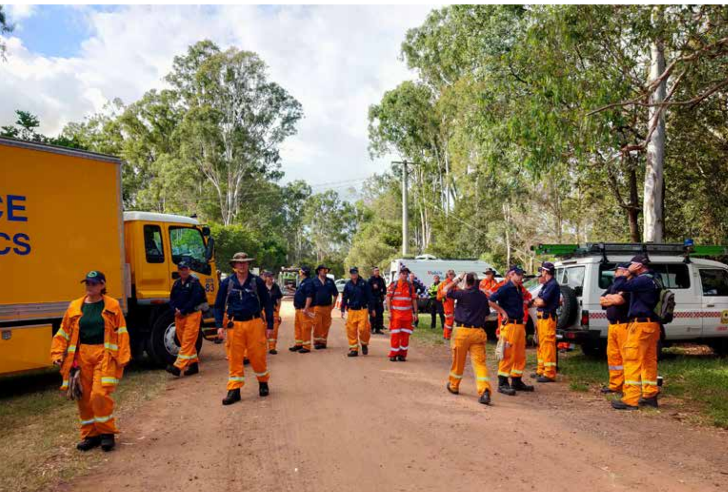
PD Quizz SES.

“The offender eventually did a U-turn and came back and handed himself into police, but Quizz did not return.