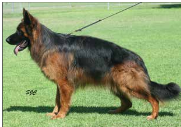
Name: Babenberg Valentino 'A' (2-2) 'Z' Normal Sire: *Lenin vd Grafenburg Dam: *Babenberg Tiffany DOB: 11/03/21