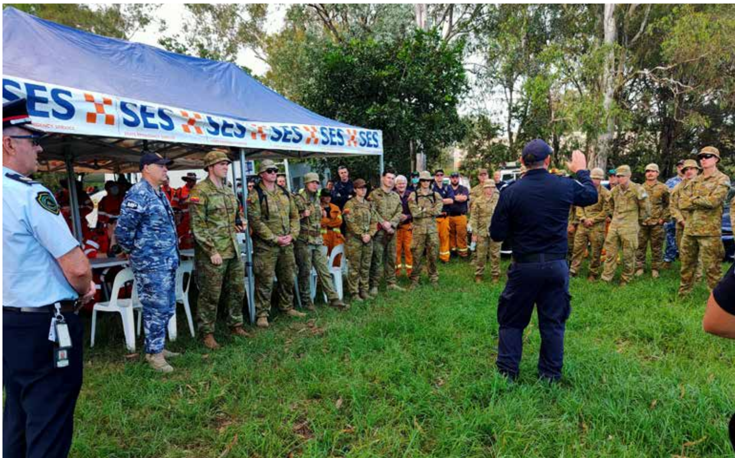
PD Quizz search group.

"In the old days, we had to rely on dogs being donated and we really didn't know their history. They often came from homes where they had become too much for the owner, however the success rate during