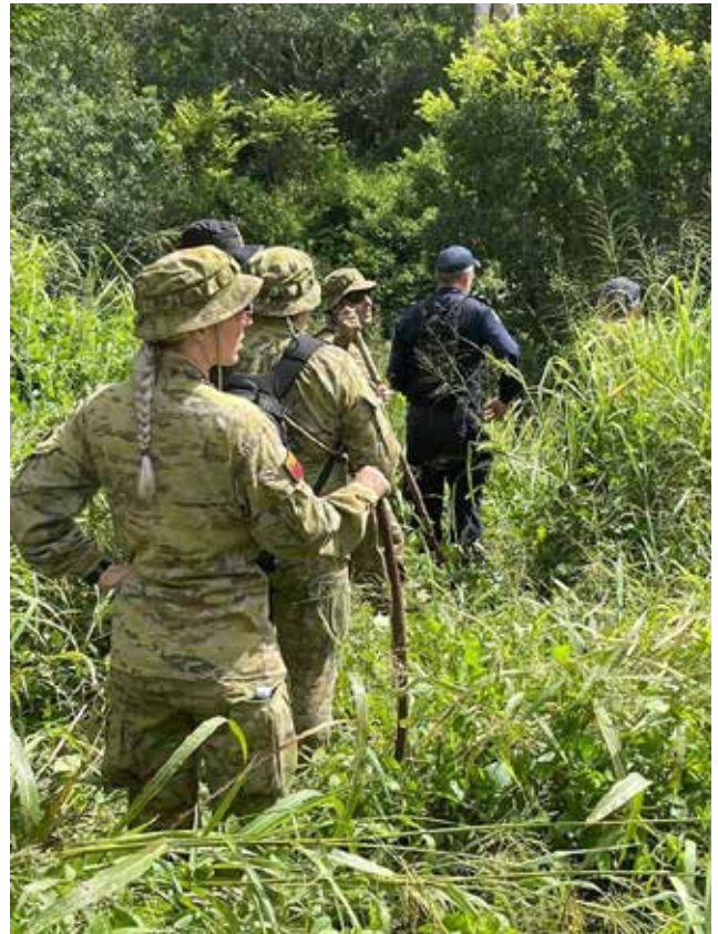
PD Quizz search conditions.