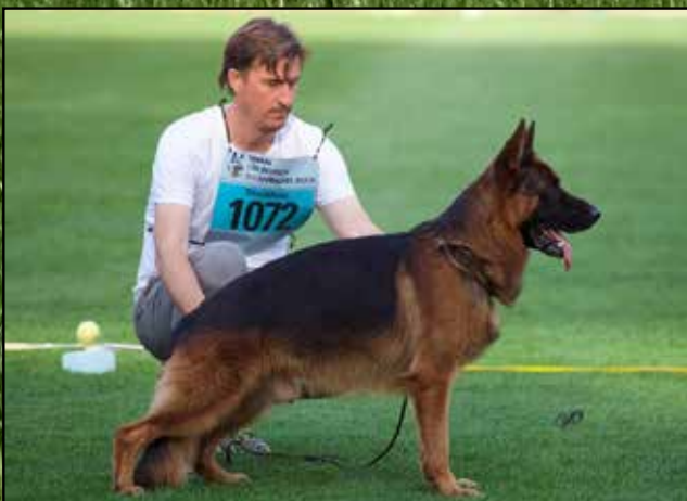
Sire: VA Kaspar von Tronje