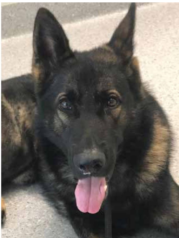
PD Quizz left eye colouring.

PD Quizz is a Sable two-year-old German Shepherd, purpose bred and trained by the Queensland Police Service (QPS) as a General Purpose (GP) police dog.