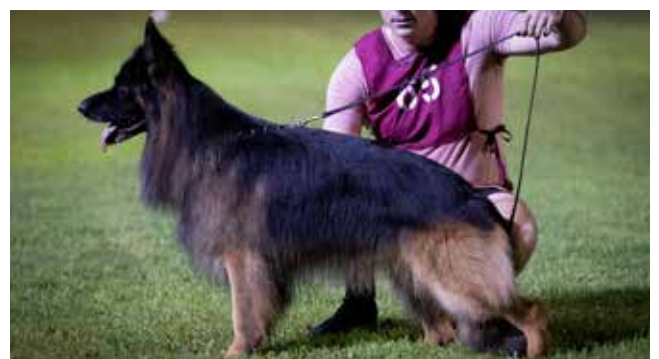
Ice Ice Baby

The open dog long stock coat class had two excellent exhibits. The first-place dog and eventual Best Dog winner, Eroica Ice Ice Baby put in a commendable performance and was shown in great coat and condition. With not much between the two, the second dog and Runner up Best Dog Lettland Flint, a balanced dog who measured oversize and gives a little away on length of neck and forereach to the first dog and wasn't quite able to match the performance of the first dog on the evening. The intermediate stock coat dog, Iccara Hard Rocco was my best dog and impresses with its type, masculinity and praiseworthy over and underlines.