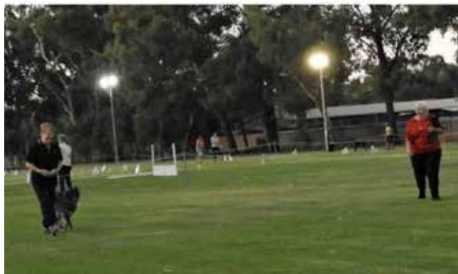
The Trophy Table for the GSDA of WA Obedience / Rally Trial