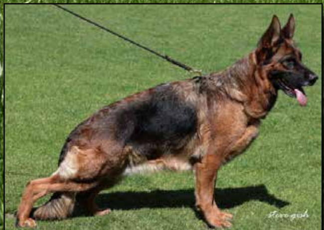
Dam: VA Fussel vom Hulsbach