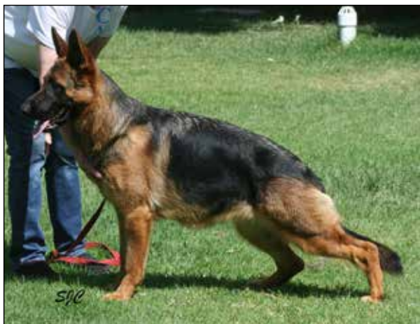
Name: Rhosyn Maybe Magic Sire: *Lenin vd Grafenburg Dam: Rhosyn Quinlyn DOB: 31/05/2021