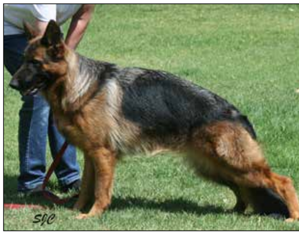
Name: Rhosyn Nice N Ezy Sire: Lenin vd Grafenburg Dam: Rhosyn Ezy Peezie DOB: 5/06/2021