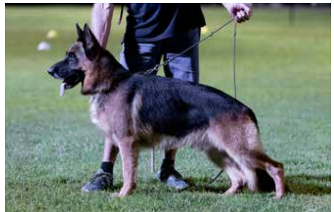
1st Open Dog SC

Lesson 2: Don't have a trailer with the spare wheel underneath.