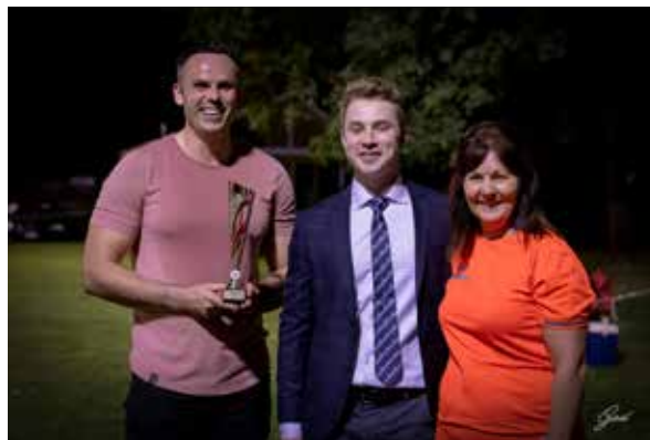
Judge and BIC winner owner and handler