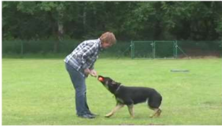
Play and prey drive - with handler