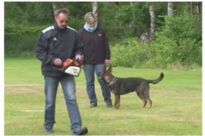
Engine noise reaction