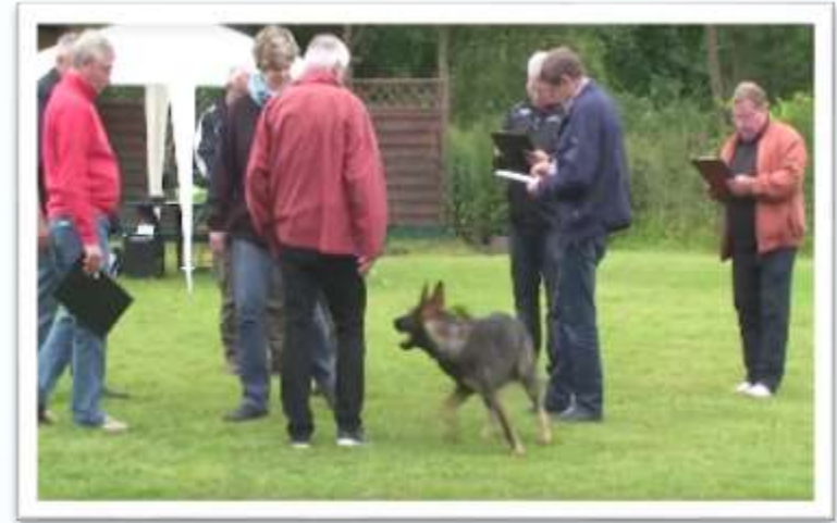
Social behavior - crowd test