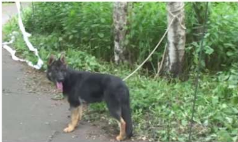
Social behavior - handler out of sight