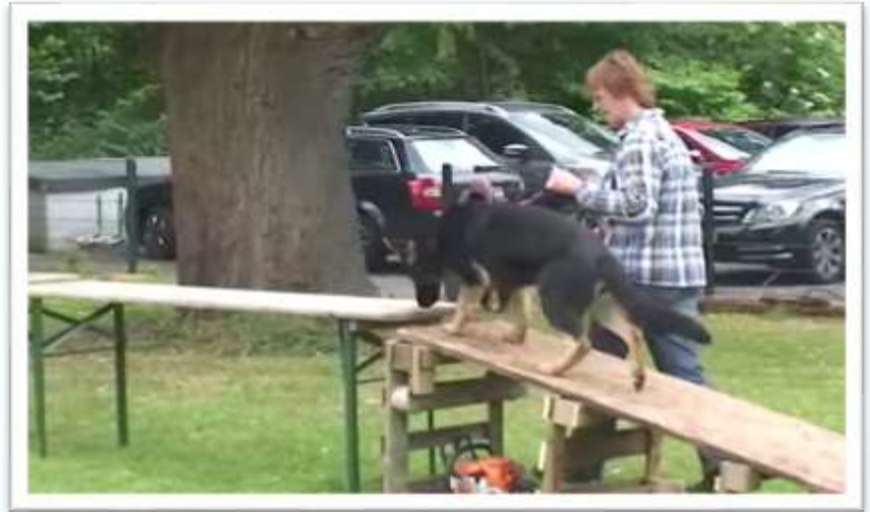
Trestle table walk