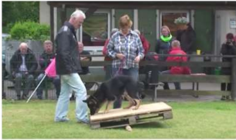
Reactions to an unstable surface